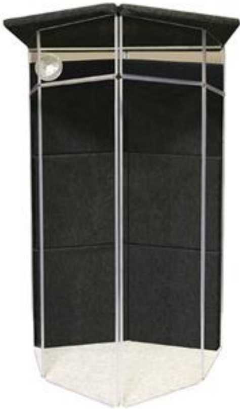
ClearSonic IsoPac Vocal Booth

You can buy a full-blown vocal booth, such as the Clearsonic IsoPac , which will run you about $1,100. You can also build your own, or convert a closet for the purpose. If you try to convert a closet or build your own booth, you should understand that simply blocking out the lawn mowers, trucks, and barking dogs is not enough. The room sound in even a tiny room can sound bad, especially in the case of a square or rectangular closet. You'll need to either stuff it full of very absorptive materials so no sound can reflect off the walls, or make sure there are no parallel surfaces –