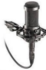
Audio Technica AT2035 $149