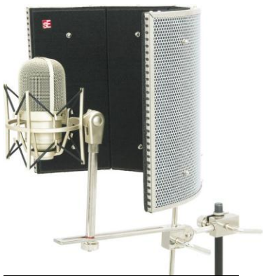
sE Electronics Reflexion Filter Pro

If you’ve watched a lot of internet videos where someone is narrating, you have almost certainly heard the echo-y room sound thing. In fact it is way too common that a very slick and professional looking video has poor audio laid over the top. Usually it sounds like the person is speaking in a bathroom or something. In the case of talking-head videos (a person talking to the camera – not the 80s rock group:)), this is almost always caused by the fact that the narrator is relying on the built-in camera mic, which is several feet away. The further your sound source is from the mic, the more room sound will be recorded.