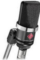
Neumann TLM 102 $700