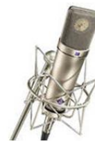
Neumann U87 ai $3,600

But the reason why there is such a range of prices is that, as I said in part 1 of this series, the more expensive mics can and do produce better quality than the cheaper ones for a variety of reasons, internal components and manufacturing specs being two biggies. Cheap LDCs often are less accurate and may sound harsh and thin in the middle to high frequencies. Also, features such as multiple pattern (cardioid/figure-8/omni), bass roll-off, and pad switches will make a mic more expensive. The good news is that you can upgrade your studio with better mics in increments of $50 – $100 at a time.